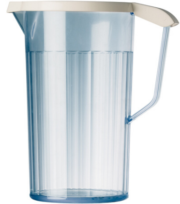
1.1 Litre Jug

Now available in purple, perfect for allergens