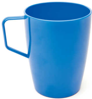
9oz Beaker with Handle