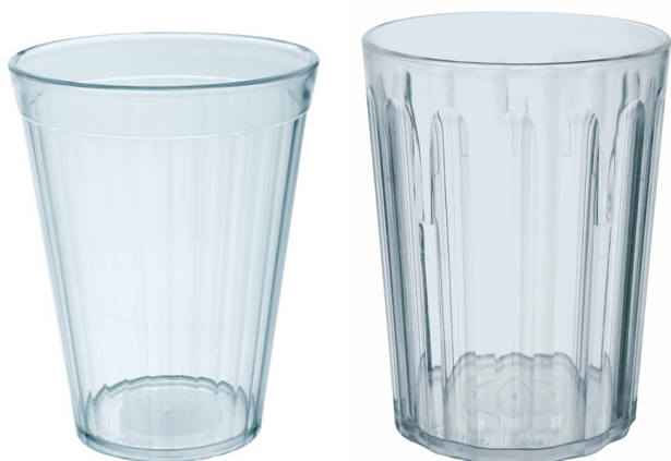
7oz & 9oz Fluted Tumblers