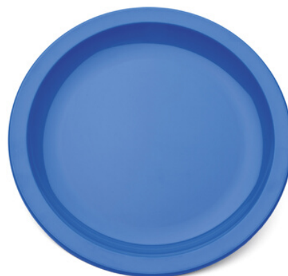
17 & 23cm Plates

Other colour options available, please contact us for more information.