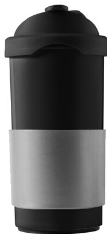
Coffee Cup & Sleeve