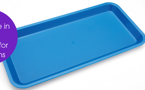
Individual Serving Platter

Now available in purple, perfect for allergens