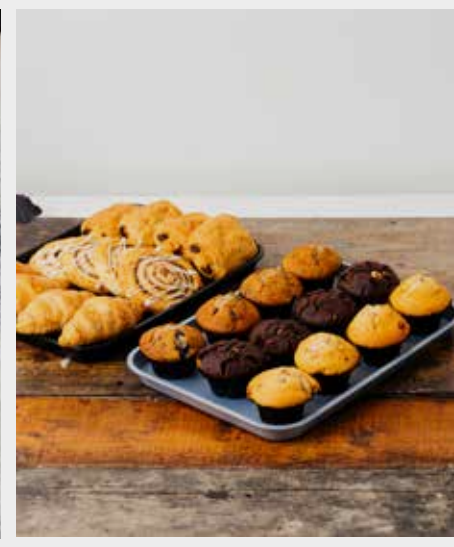
35x25cm Display Tray Code: 081