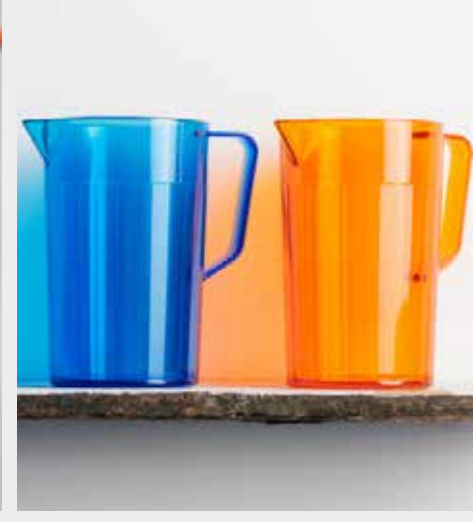
1.1 Litre Copolyester Jug Code: 540