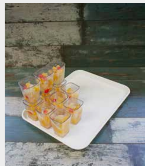
White 41x30cm Display Tray Code: 055WHI