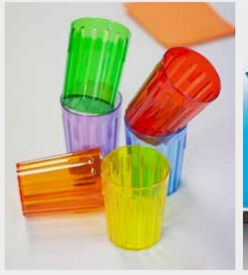
250ml Copolyester Fluted Tumbler Code: 519