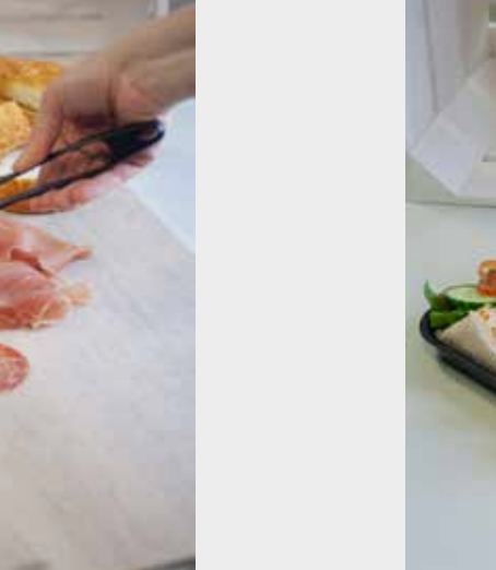
Black 27cm Tweezer tongs