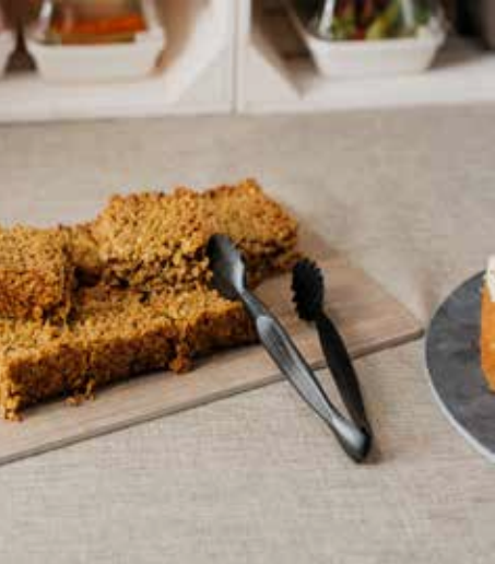
Black 18cm Small Tongs Code: 253BLA