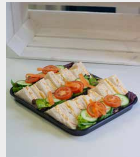
Black 30x25cm Display Tray Code: 057BLA