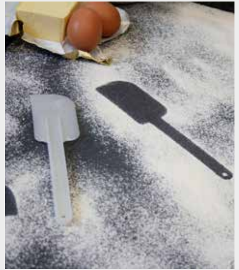
Natural Coloured Spatula Code: 051NAT