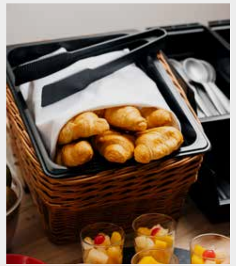
Black 28.5cm Serving Tongs Code: 716BLA